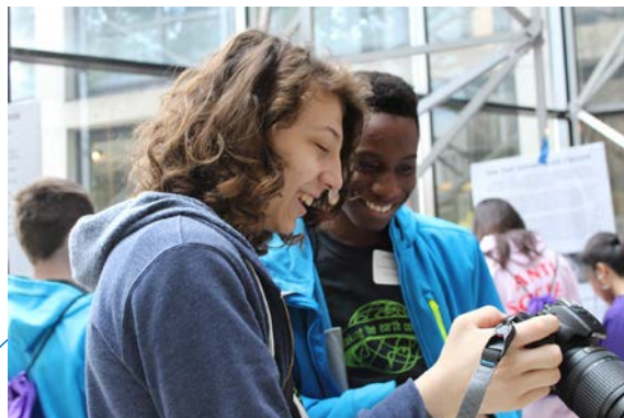
Students enjoy the 12th Annual Youth Summit on Climate and Sustainability