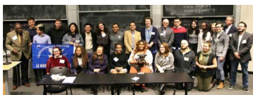
Student leaders gather with panelists at the day-long conference on nuclear proliferation